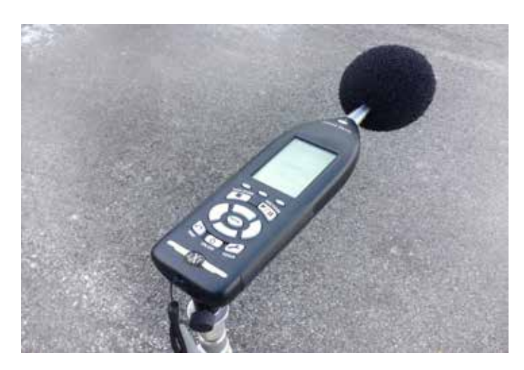
Figure 1 - Sound Level Meter