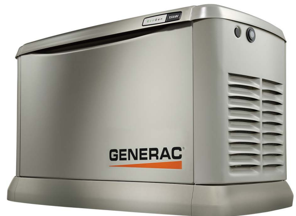
Product shown with optional fascia kit

G007163-0 (Aluminum - Bisque) - 15 kW 60 Hz